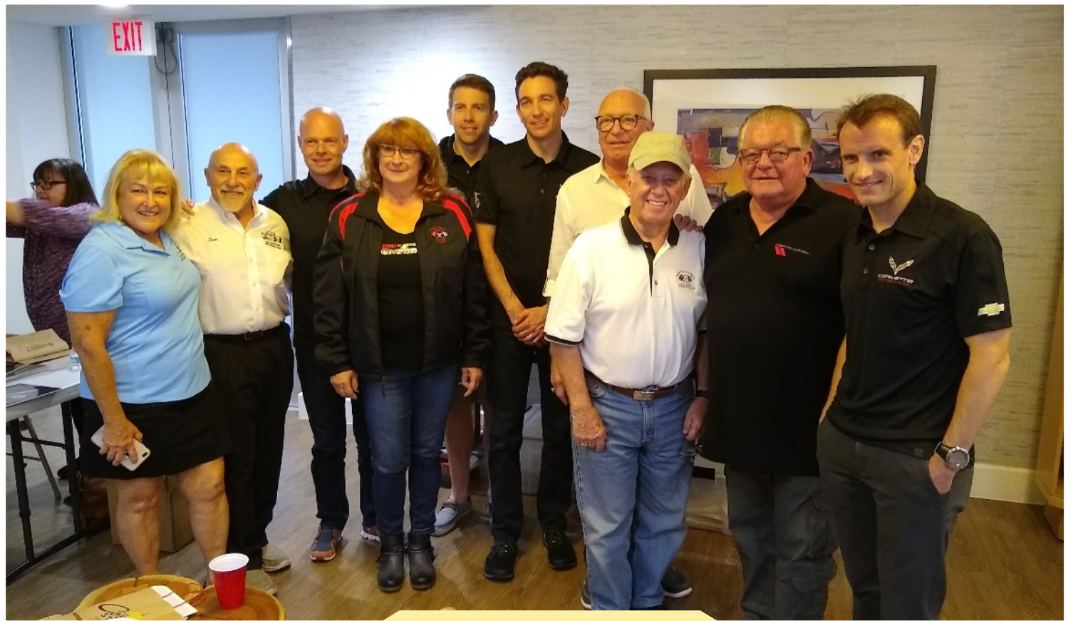
Long Beach Grand Prix

What's Inside: President's Corner Board of Directors Club Events Calendar About Our Club